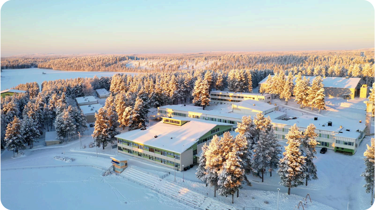
Competition venue and Kotivaara

Event center & Competition center address: Koulutie 2 D, 97900 Posio